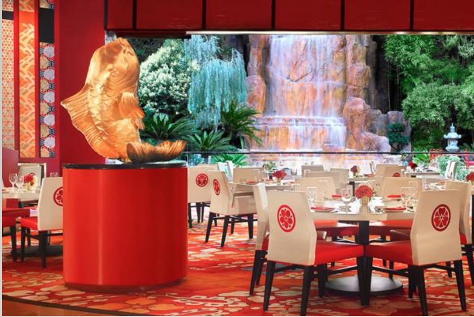
MIZUMI RESTAURANT - WYNN CUSTOM EMBROIDERY