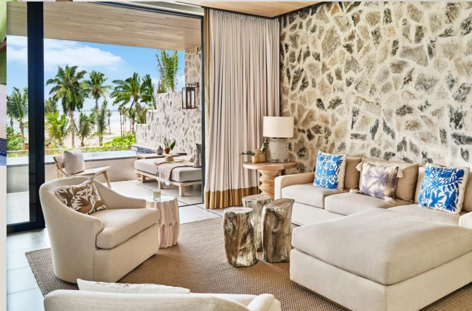
SUSURROS DEL CORAZON, MEXICO SOURCED INDOOR/OUTDOOR PAUL DEUSING PARTNERS PROJECT DYNAMICS