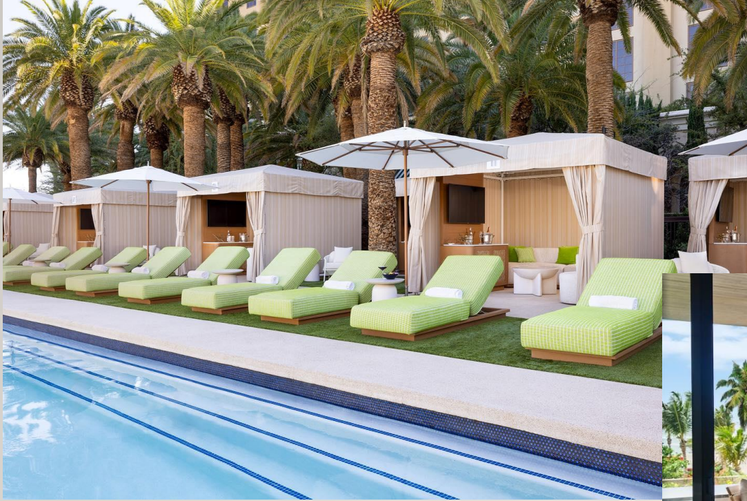
GVR, LAS VEGAS CUSTOM OUTDOOR CABANA KLAJ JUBA WALD PMI