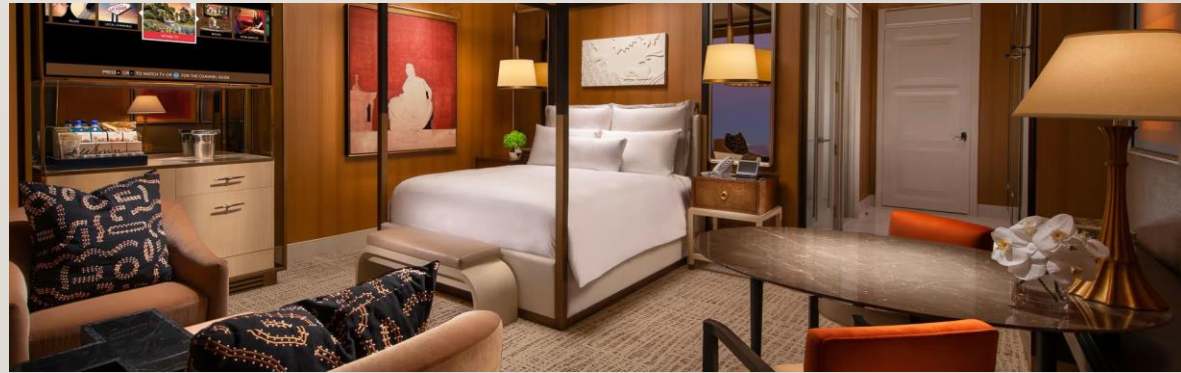
WYNN LAS VEGAS CUSTOM BENCH, BED, AND PILLOWS