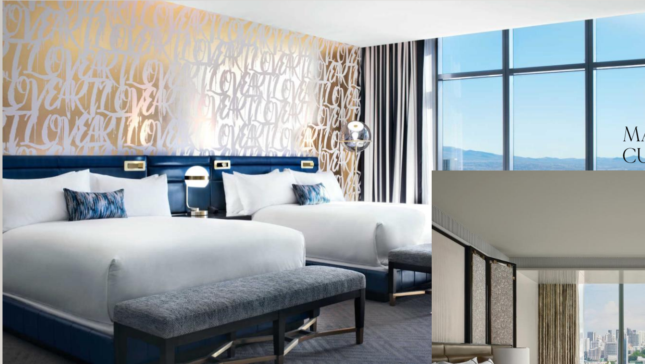
MARINA BAY SANDS CUSTOM BENCH AND HEADBOARD